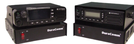
Left : Motorola XPR 5550 w/LPH-MOT/CDM Right: Motorola XPR 2500 w/LPH-MOT-PM/VTX

Model shown is for descriptive purposes only. Each model design will vary based on the radio it is meant to house.