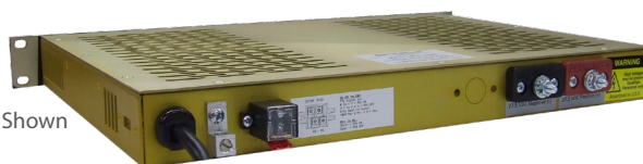
*Front & Rear of BC & BMS Version Shown 1.75" H x 19" W x 14" D

The high efficiency HE1U series DC power supply is designed to provide maximum power in a small package. These high power density units are only 1RU high and 14" deep, yet are able to provide up to 1600 watts from a single AC power outlet. Built into our sturdy chassis with ¼ inch output studs and a terminal strip for DC-OK and internal power supply remote On/Off control.