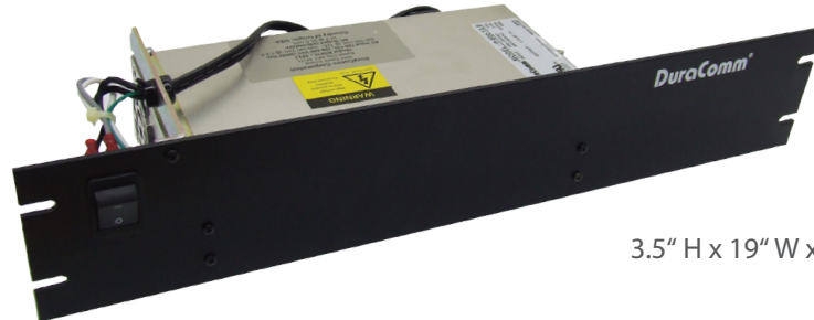
3.5" H x 19" W x 4" D