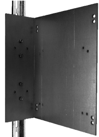
Weight - 1.5 lbs 9.75" H x 3.25" W x 8" D