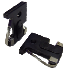
*GMT fuses not included